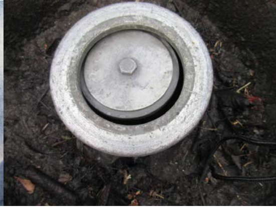
'Poppet Valve' not sealing