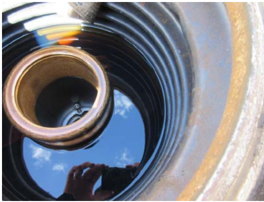
Excess standing liquid