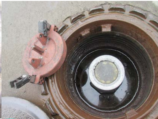
Dust Cap worn or ineffective