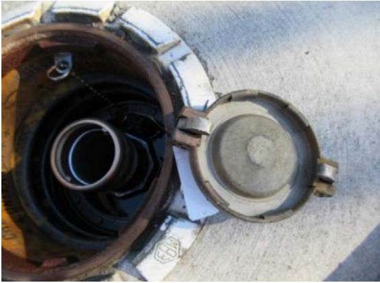
No gasket/seal on fill tube